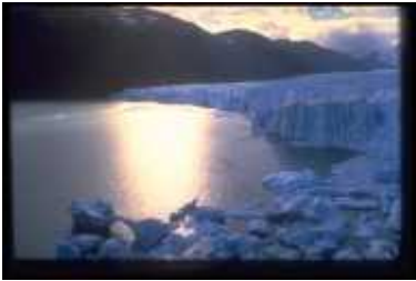
"Glacier Perito Moreno"(Santa Cruz)