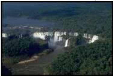
"Cataratas del Iguazu" (Misiones)