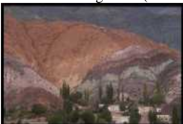
Jujuy (Pumamarca – Quebrada de Humahuaca)