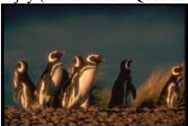
Chubut (Puerto Madryn)