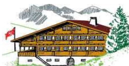
Our Chalet Adelboden Switzerland

Welcome to the second Australian Friends of the World Centres newsletter for 2011! We hope that you will enjoy following the latest events at our four World Centres, and the reports from our members who visit them throughout 2011 – especially our participants in the Young Women's World Forum!