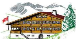
Our Chalet Adelboden Switzerland

Welcome to the first Australian Friends of the World Centres newsletter for 2011! We hope that you will enjoy following the latest events at our four World Centres, and the reports from our members who visit them throughout 2011 – the second of the official Centenary celebration years!