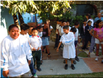
Working with the community organisation Vamos.

Before leaving Australia to come to Our Cabaña in Mexico I thought a lot about what I would experience and what I