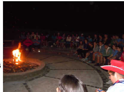
New Year's Event Campfire

I would like to thank everyone inside and outside of Guiding who helped me to obtain this opportunity and everyone at Cabaña who has made it such a successful experience for me.